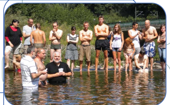
Baptism in the river