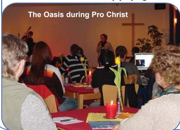
The Oasis during Pro Christ