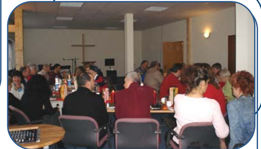
Christmas fellowship in the sanctuary in Kamenz.