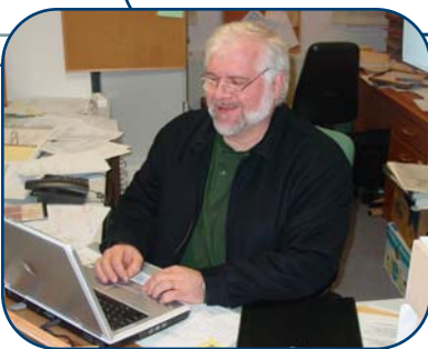
Pray for us as we develop the curriculum for the teaching!

R emember to thank the Lord for the growth in Dresden-Gorbitz. We are now 72 members. Also pray for divine direction as we are looking for a larger facility for Sunday services as we are quickly outgrowing the old one.