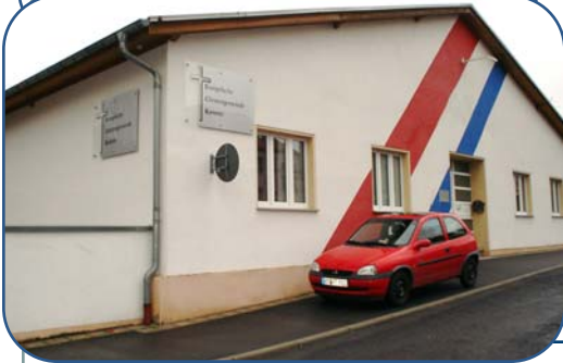
The new building in Kamenz.

After an intensive time of renovations the new facility in Kamenz is now finished. The new facility has brought a boost to the people in the Kamenz church plant. Many Sundays we now have an attendance of 40 people or more. We were able to take in 5 more members and we are starting up a children's ministry.