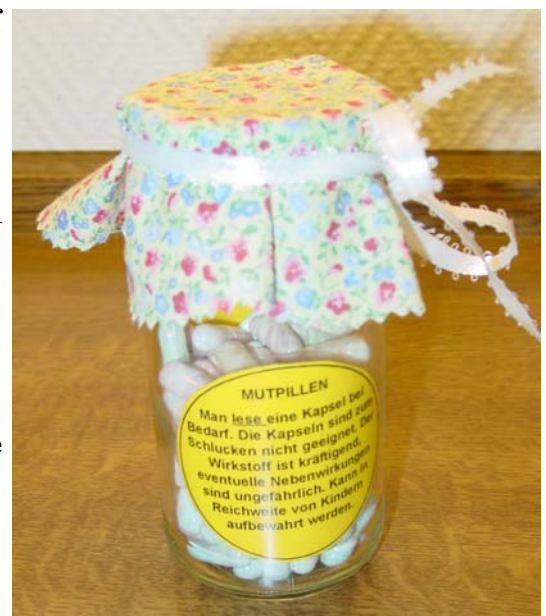
The finished jar of Courage capsules